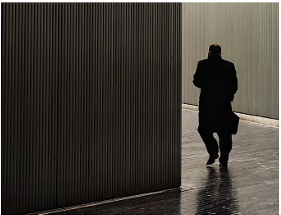
Cutting corners: many banks are reassessing their methods of risk control, prompted by the recent spate of fines issued by regulators